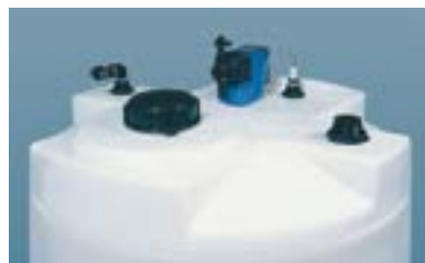
Molded in pump shelf is recessed in the top of the tank. Shown w/optional metering pump.