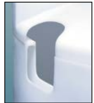
Inner tank dome overlaps outer tank to prevent contamination.