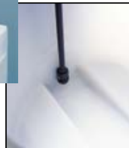
Molded in sump in the primary tank is located directly below the pump shelf. Suction lines can be lowered onto the sump area, which will allow for maximum drainage of chemical with top discharge assemblies.