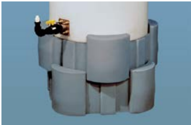
Optional polyethylene stands, which may be stacked 2-high, support the primary tank for gravity feed.